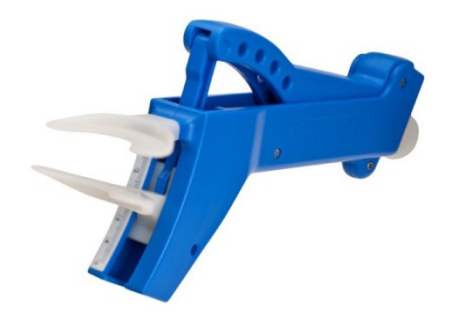
Figure 1 TheraBite® Jaw Mobilizer

The TheraBite Jaw Mobilizer (Figure 1) utilizes repetitive passive motion and stretching to restore mobility and flexibility of the jaw musculature, associated joints, and connective tissues. The TheraBite is the only device available which provides patients with anatomically correct jaw motion. It also helps reduce patients' anxiety by allowing them to control the extent and length of each stretch. While conventional therapies offer mostly stretching to increase jaw opening, the TheraBite provides both anatomically correct stretching and passive motion for effective jaw rehabilitation therapy. The device is available in an Adult and a Pediatric version.