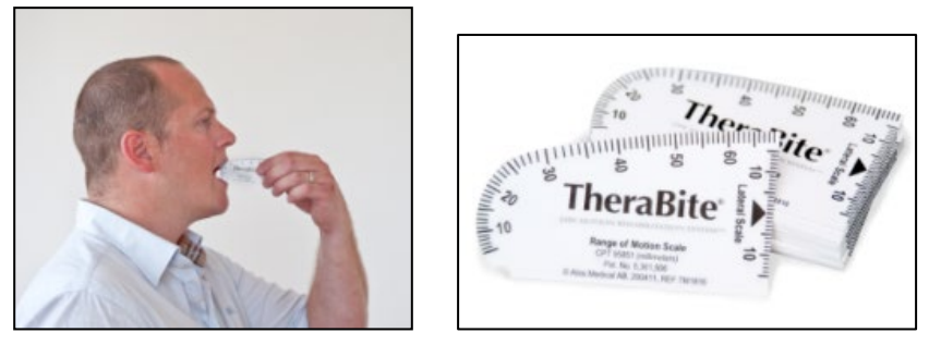
Figure 3 Range of Motion Scale (RAM)

The disposable Range of Motion Scales is used to measure and monitor progress of the exercise, by the user or his/ her clinician.