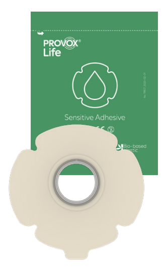
Provox Life adhesives are clover-shaped for optimal comfort and fit.