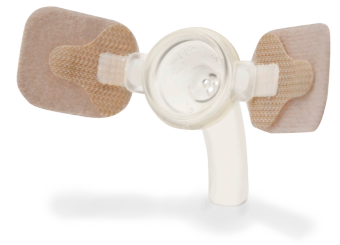
Provox LaryTube with Provox LaryClips