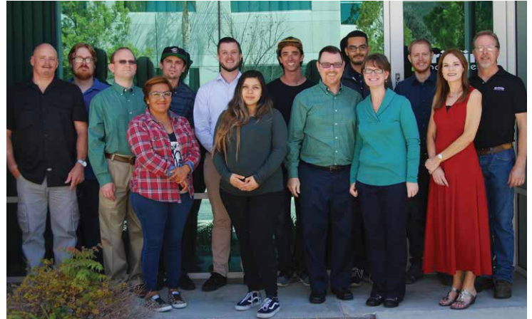
Welcome the Griffin Laboratories Team to the Atos Medical family!

Atos Medical, the world leader in the design, manufacture and distribution of quality laryngectomy products, has acquired Griffin Laboratories, the leader in the design and manufacture of electronic speech aids (a.k.a. electrolarynx). This union is a natural fit, given that both companies share an