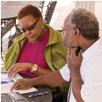
Griffin Laboratories has been manufacturing speech aids since 1995.

Atos Medical, the world leader in the design, manufacture and distribution of quality laryngectomy products, has acquired Griffin Laboratories, the leader in the design and manufacture of electronic speech aids (a.k.a. electrolarynx). This union is a natural fit, given that both companies share an