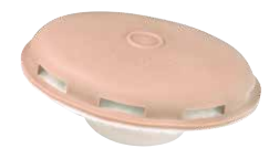
Provox Micron HME

The Provox Micron was introduced in 2007 and has been specifically designed to provide the pulmonary benefits of an HME coupled with an effective electrostatic filter to block small airborne particles in inhaled air like bacteria, viruses, pollen and dust. Provox Micron HME can be used in situations or activities such as shopping in malls or supermarkets, gardening, wood working, cleaning or traveling by airplane. A prescription is required, be sure to contact your clinician if you are interested in the benefits of Provox Micron.