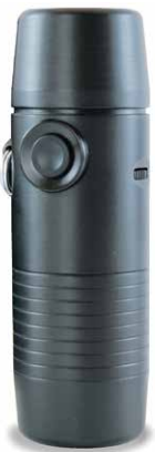
TruTone Plus™ Electrolarynx manufactured by Griffin Laboratories

unwavering commitment to enhancing the quality of life for those living with a laryngectomy, both have been close and trusted partners for years and Atos today is the largest customer of Griffin. You will continue to receive the same quality products and service that you have come to expect, as the Griffin team will remain intact, still serving as a key supplier to Atos Medical. Our deeper collaboration will only act to enhance the level of service we can provide to you, our customer.