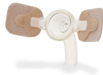
Provox LaryTube with Provox LaryClips